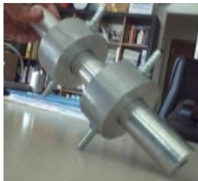
Example: 300mm (12") Wave-Guide