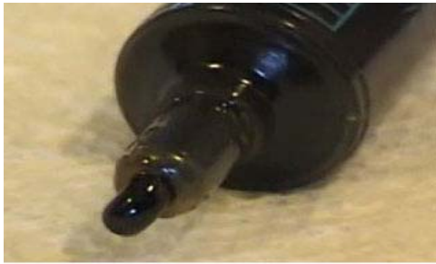
Cannabis Oil - Miracle Natural Medicine with NO SIDE EFFECTS

For those of you who have watched the documentary " Run from the Cure ", this should answer any questions about producing your own hemp oil.